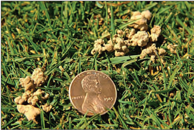
Figure 3. An excellent indicator of a healthy soil is the presence of earthworms or earthworm castings.

Applying carbohydrates and proteins, ingredients usually not included in many synthetic fertilizers, is part of a “feed the soil” philosophy. Maintaining a balanced, healthy soil system ensures that the essential nutrients we apply are used efficiently (Figure 3).