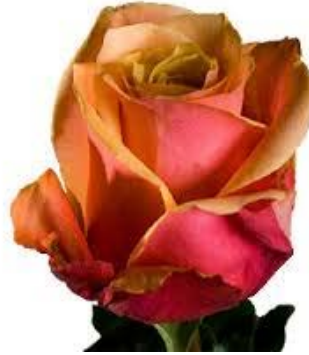
Cherry Brandy (Fascination-desire)