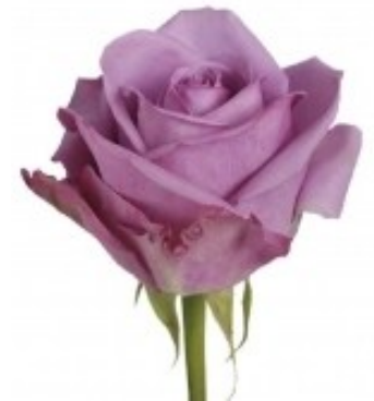
Cool Water (Enchantment)