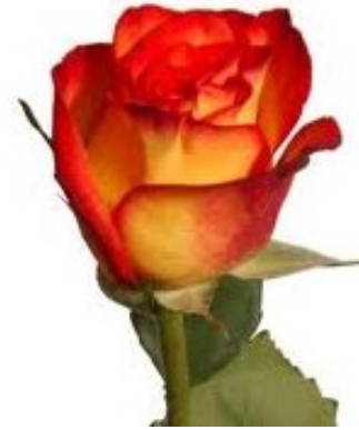
High & Magic (Sincerity- appreciation)