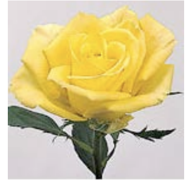
Skyline (Joy-New Beginnings)